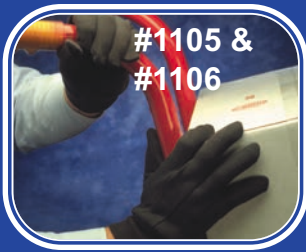
#1105 & #1106