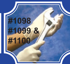
#1098 #1099 & #1100