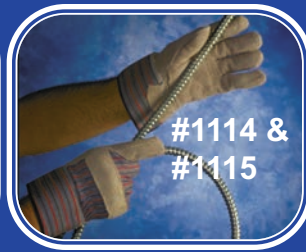
#1114 & #1115